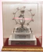
Aashirwad OLI awards