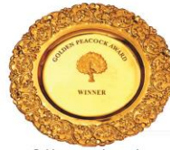
Golden peacock award for National Training 2018