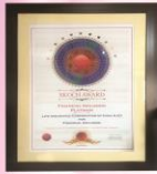
SKOCH award 2018 Platinum category Financial Inclusion