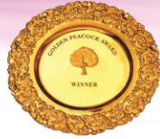
Golden Peacock Award 2017 Excellence in Corporate Governance