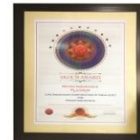
SKOCH award 2018 Platinum category Micro Insurance -for Group Insurance