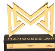
The Marquees awards 2017