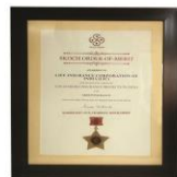
SKOCH Order of Merit -2018 Top 20 Micro Insurance Projects in India-Group Insurance